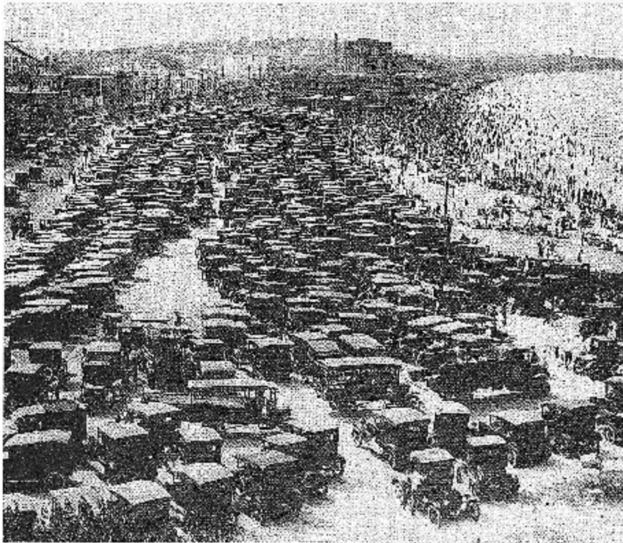
A picture of a seaside resort near Boston, Massachusetts, July 4, 1926.